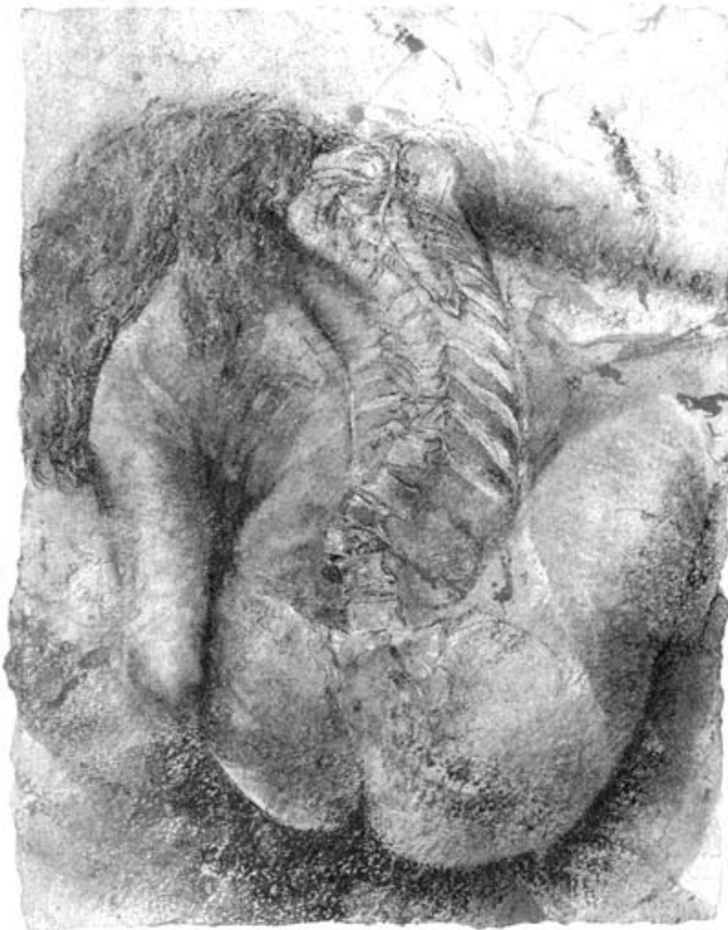
Laura Ferguson Crouching Figure With Visible Skeleton